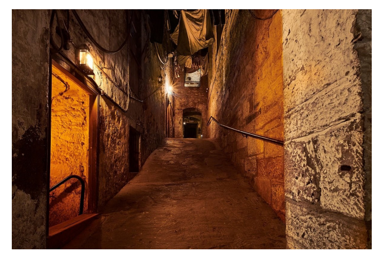
Mary King's Close. From https://www.tripadvisor.com/ Attraction_Review-g186525-d191321-Reviews-The_Real_Mary_King_s_Close-Edinburgh_Scotland.html.