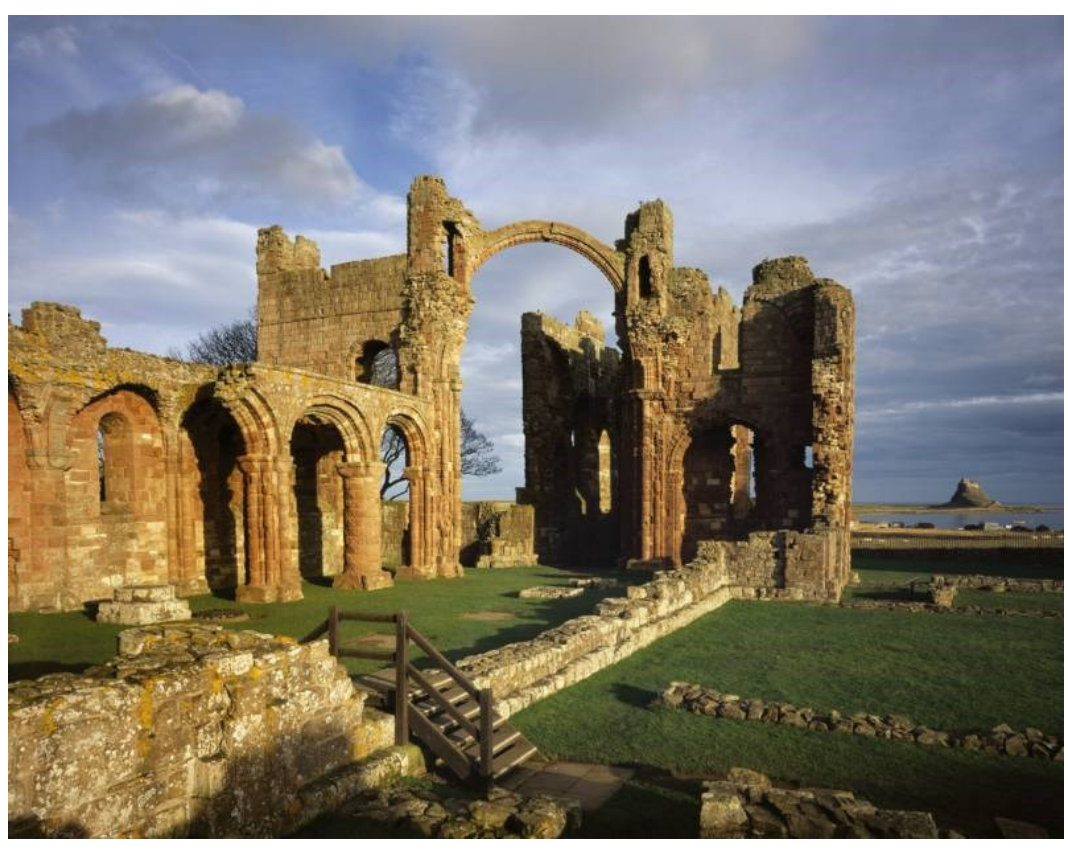
Lindisfarne Priory.

In 933 King Athelstan invaded Scotland with a land and naval force, and harried much of the country. Again in 937, King Athelstan destroyed a combined army of Scots and Norsemen led by Olaf at the Battle of Brunanburh.