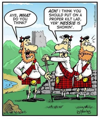
The first, and last appearance of the mini-kilt.