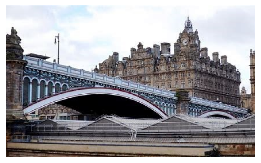
North Bridge, Edinburgh.