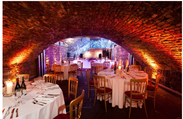
Marlin's Wynd.