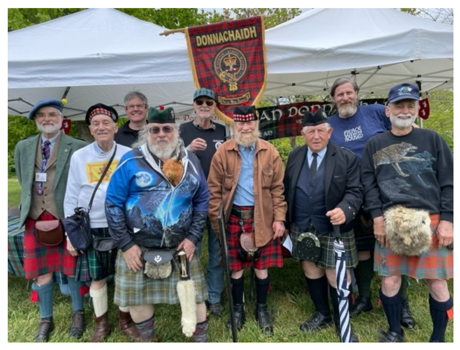
Clan Donnachaidh at the Southern Maryland Celtic Festival, St. Leonard, Maryland, April 27, 2024.