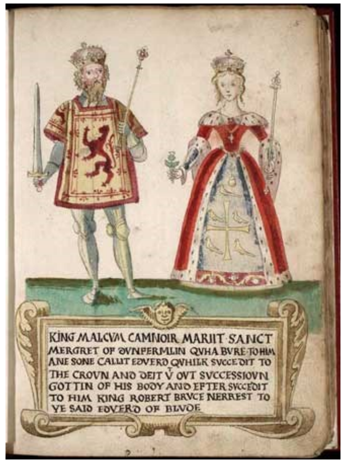
Portrait of Malcolm III and Margaret, from the Forman Armorial (1562).

In 1079 King Malcolm III came into England with a great army, ravaged Northumbrian land up to the Tyne, killed many hundreds of men, and took home much plunder. (Malcolm Canmore's goal was to extend the Scottish kingdom southward