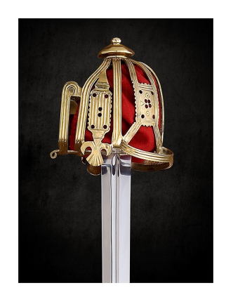
Basket hilt sword.

Alexandria Scottish Christmas Walk.