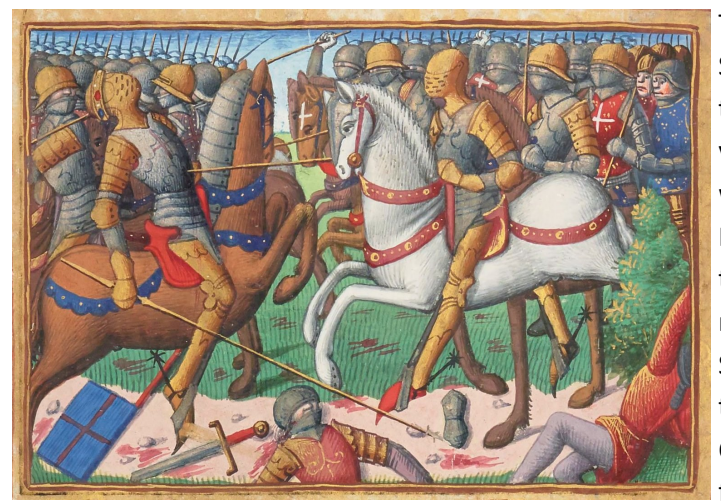
Battle of Bauge. Image from armeehistoire.fr.

With King James I of Scotland a prisoner in England, Robert Stewart, first duke of Albany, was in command of the Scottish government. Regent Albany decided to send 6,000 volunteers. A fleet of ships from Castile reached Scotland, embarked the men in September 1419, and by the end of October the Scots had landed and reached the Dauphin's army in the Loire Valley. The Scots were led by the earls of Wigtown and Buchan.