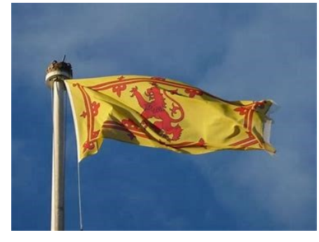
The Royal Standard.

Following the Battle of Bannockburn in 1314, the Declaration of Arbroath officially named Saint Andrew as the patron saint of Scotland. The saltire became the official national flag in 1385 when the Scottish Parliament agreed that Scottish soldiers should wear a white cross to distinguish themselves from the enemy during battle.